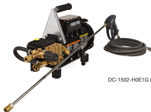
DC-1502-H0E1G (Hand Carry)